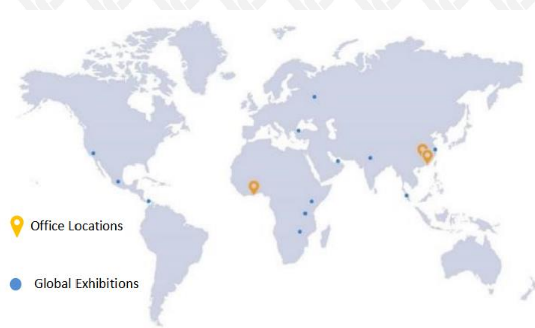
Pic No. 8