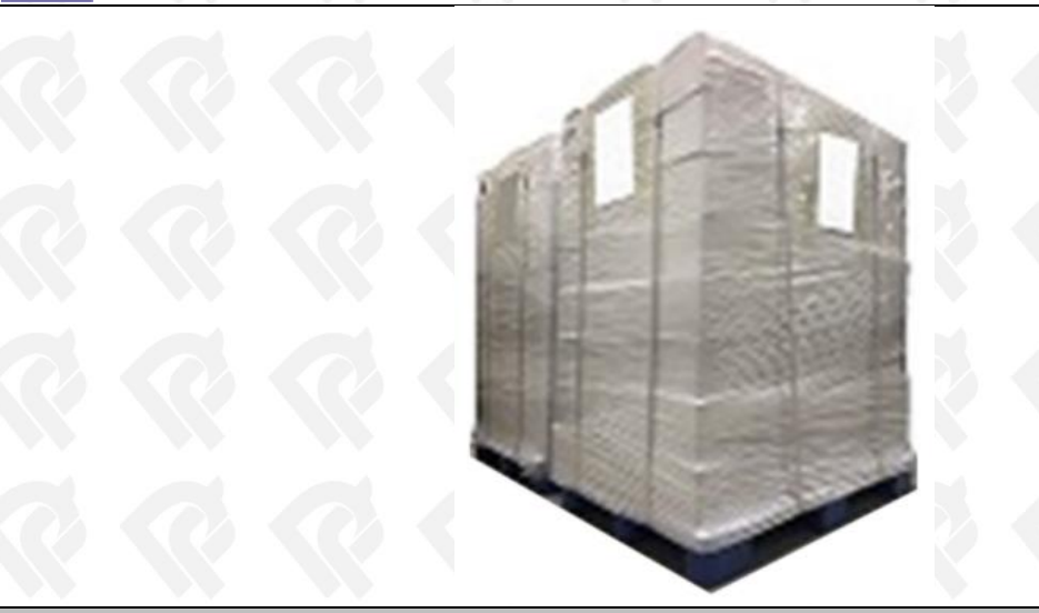
Pic No. 7

Pallet Shipping: Use pallet that meet export requirements, and use white wrapping protective film to wrap and bind with cable ties