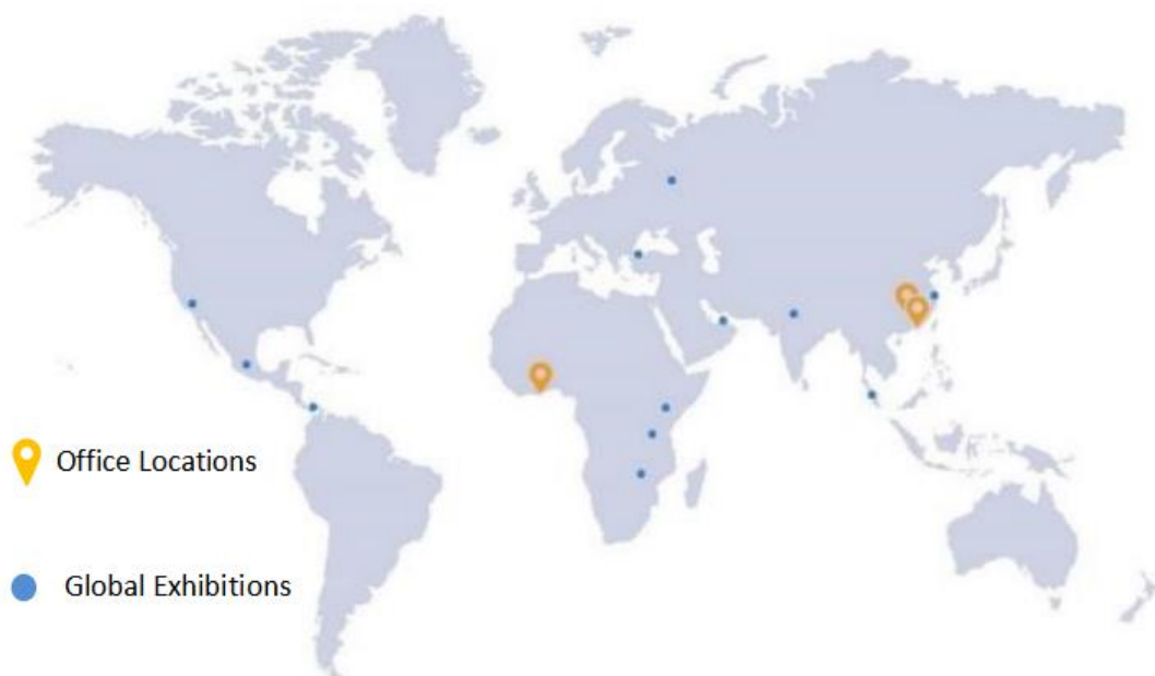
Pic No. 8