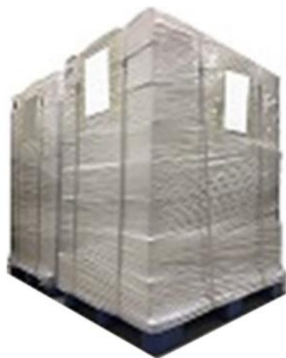
Pic No. 7

Pallet Shipping: Use pallet that meet export requirements, and use white wrapping protective film to wrap and bind with cable ties