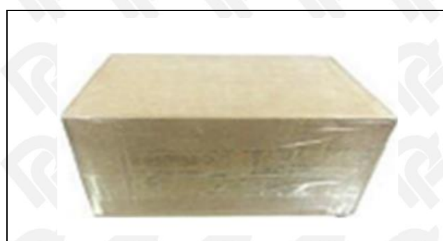
Pic No. 5

▲ Minors are prohibited from using transparent tape, yellow tape, black wrapping protective film, and white wrapping protective film to avoid personal injury.