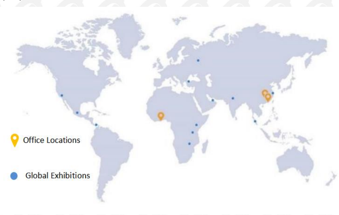
Pic No. 8