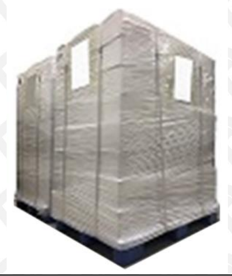
Pic No. 7

Wrapped with yellow tape after wrapping black protective film