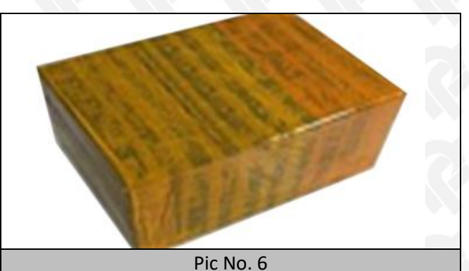
International express packaging:

Wrapped with yellow tape after wrapping black protective film