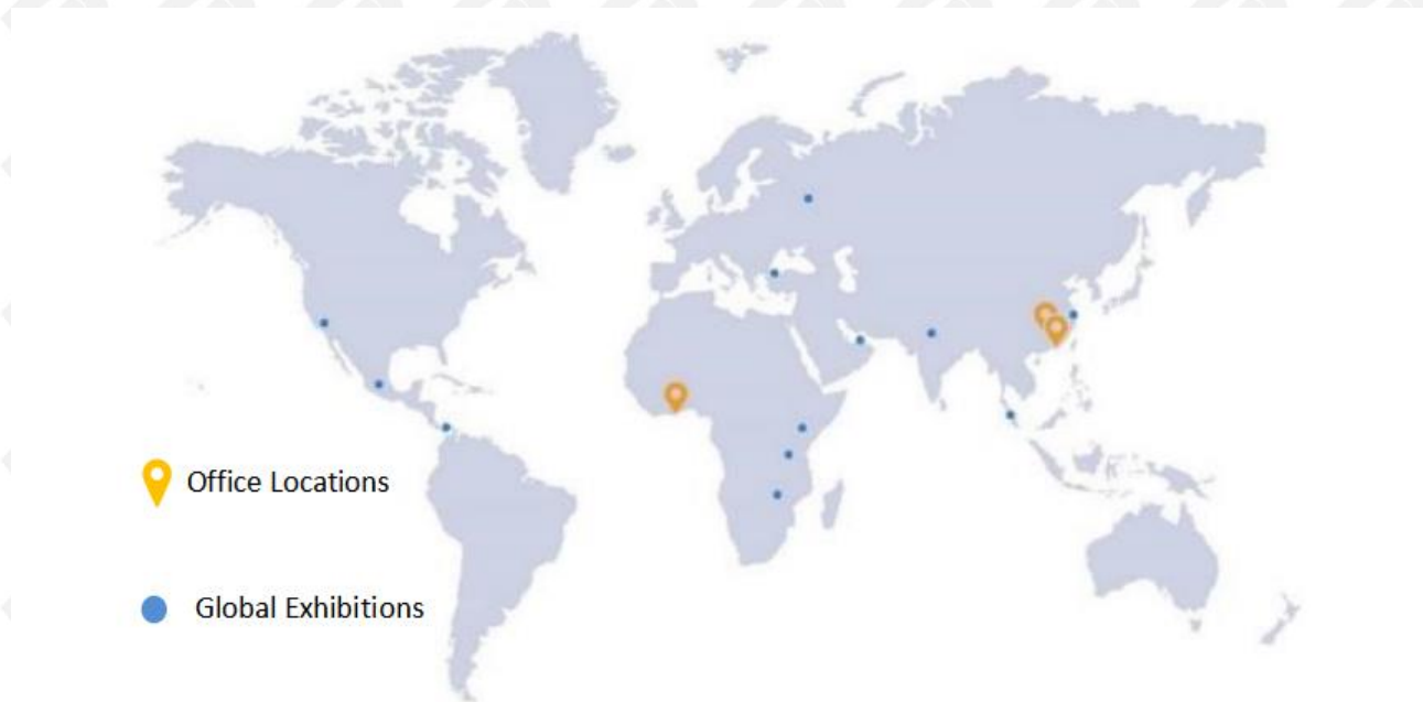
Pic No. 8