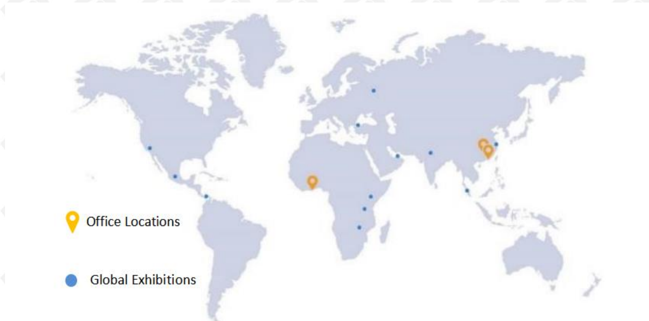
Pic No. 8