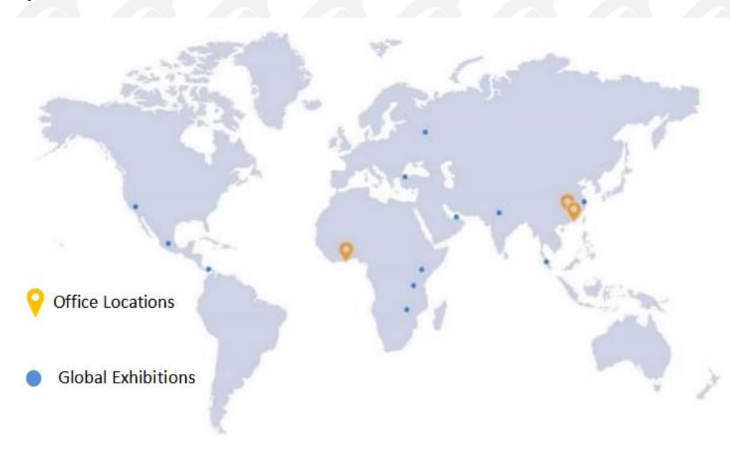
Pic No. 8