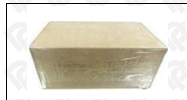
Pic No. 5

▲ Minors are prohibited from using transparent tape, yellow tape, black wrapping protective film, and white wrapping protective film to avoid personal injury.