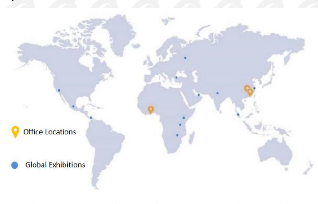
Pic No. 8