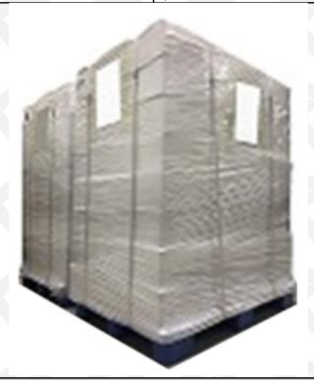
Pic No. 7

Wrapped with yellow tape after wrapping black protective film