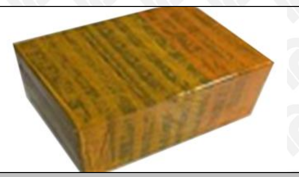
Pic No. 6