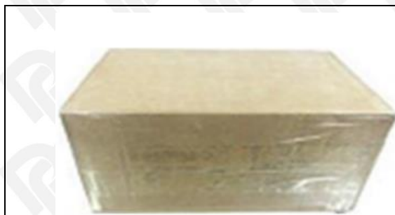
Pic No. 5

▲ Minors are prohibited from using transparent tape, yellow tape, black wrapping protective film, and white wrapping protective film to avoid personal injury.