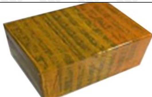
Pic No. 6