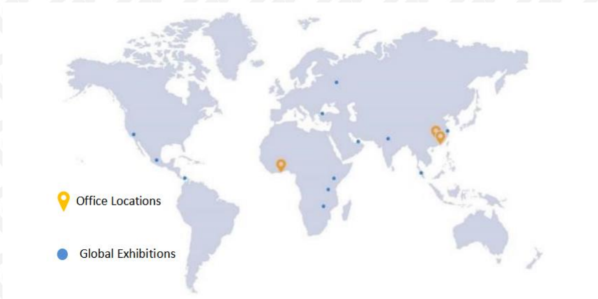
Pic No. 8